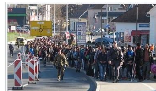
Migrants and the monitoring Slovenian army at the border of Gornja Radgona, Styria, Slovenia

Persons moving from their home due to forced displacement (such as a natural disaster or civil disturbance) may be described as displaced persons or, if remaining in the home country, internally-displaced persons. A person who seeks refuge in another country can, if the reason for leaving the home country is political, religious, or another form of persecution, make a formal application to that country where refuge is sought and is then usually described as an asylum seeker. If this application is successful, this person's legal status becomes refugee.